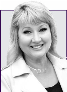
ELESA DOLL BROKER