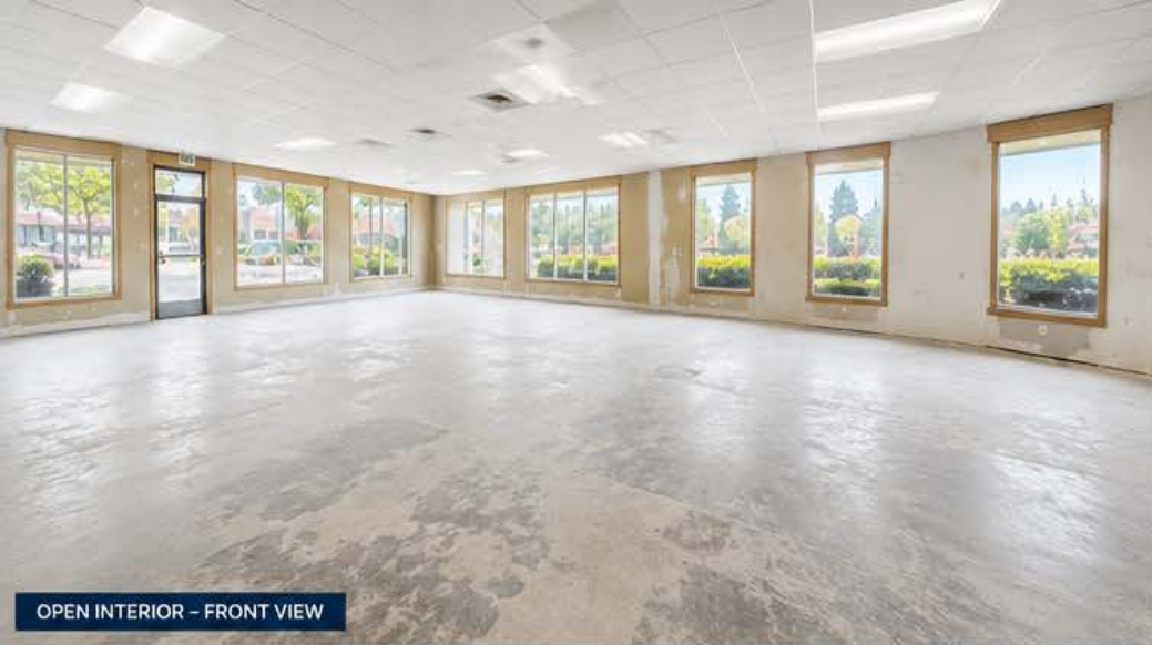
OPEN INTERIOR – FRONT VIEW