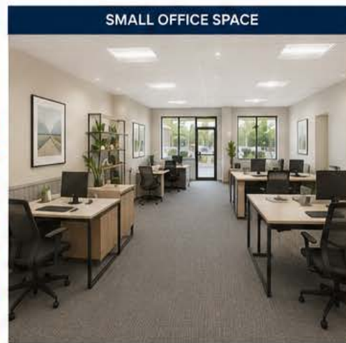
SMALL OFFICE SPACE