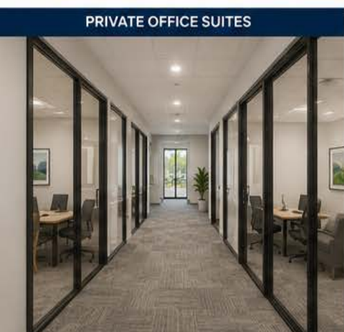
PRIVATE OFFICE SUITES