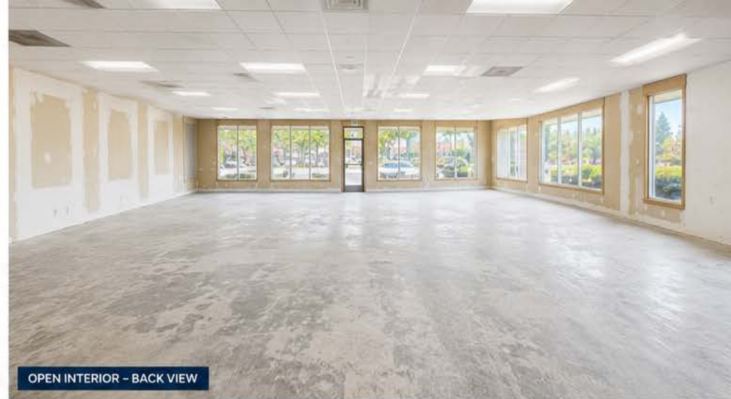
OPEN INTERIOR – BACK VIEW