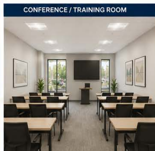
CONFERENCE / TRAINING ROOM